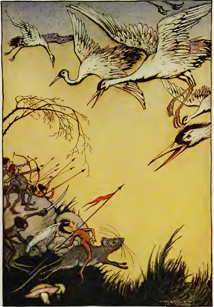
They were constantly at war with the cranes